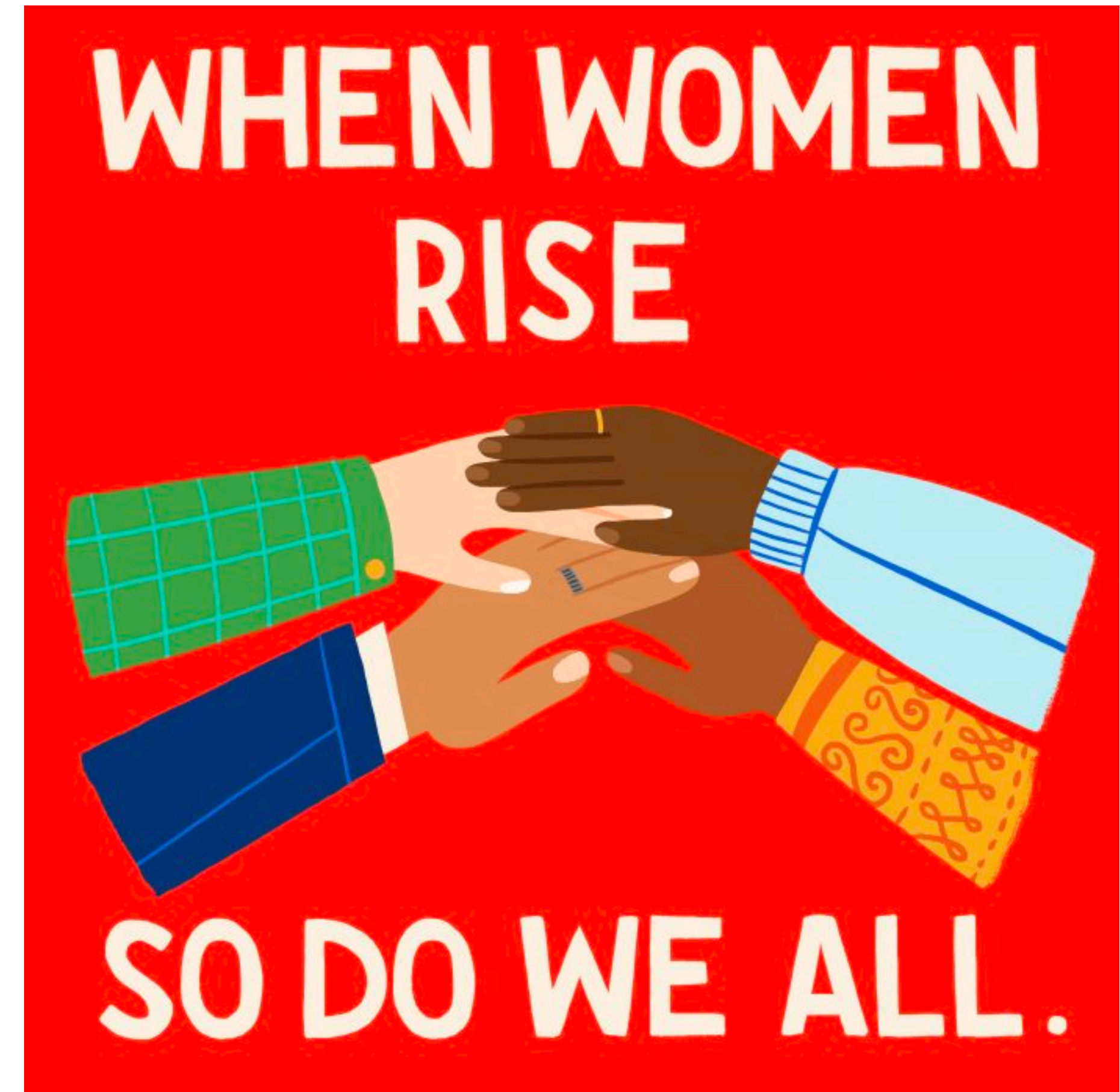
An illustrative poster work on gender equality.