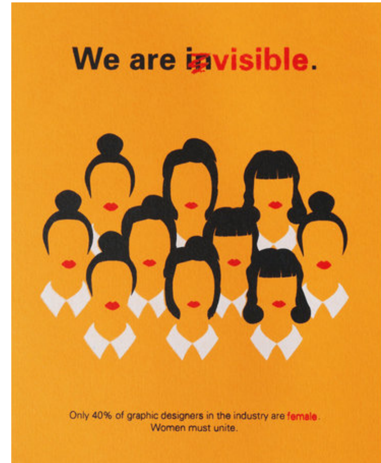
Awareness project for woman unite poster work.