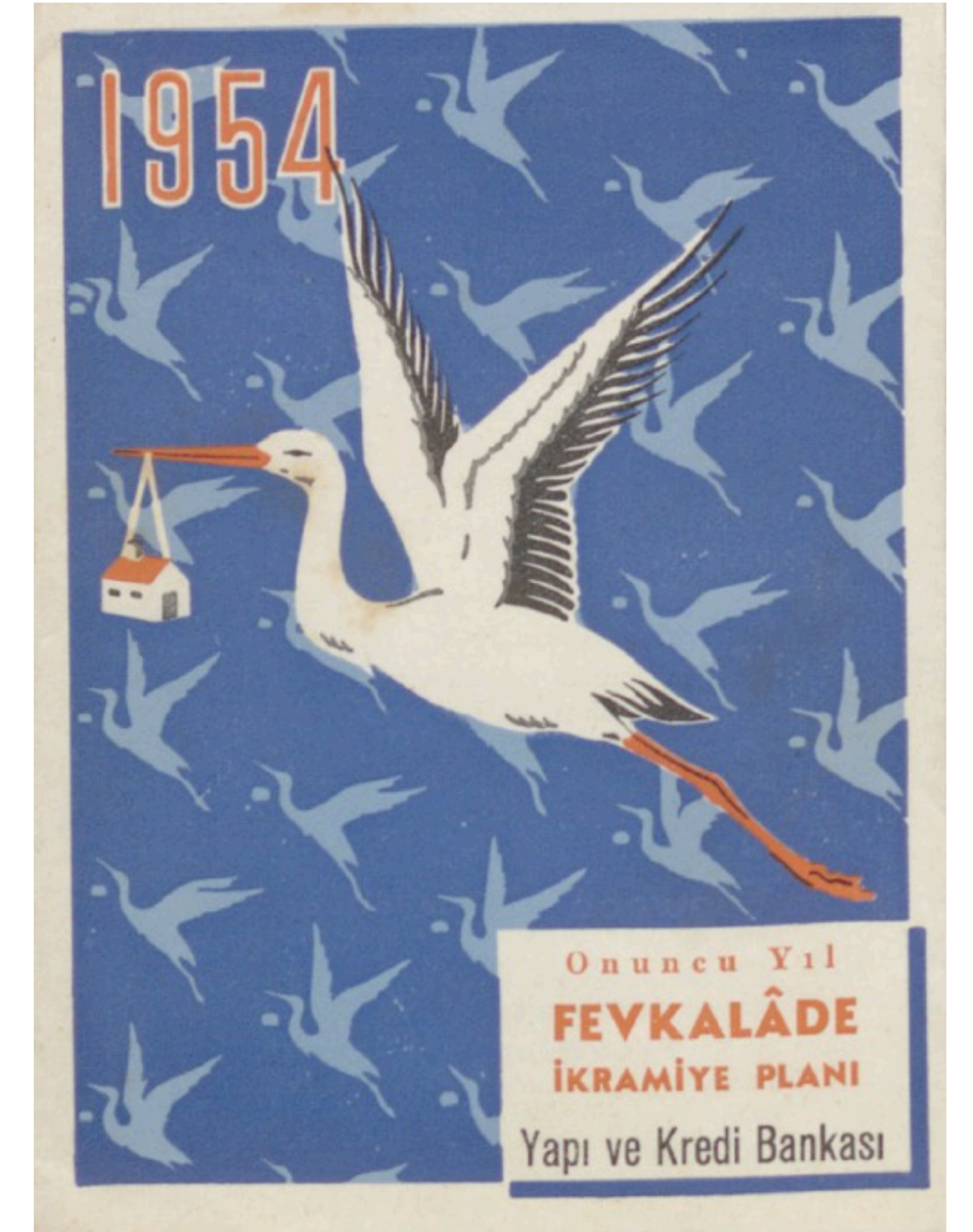
Poster and cover designs.